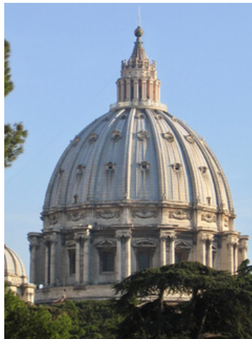
The Dome of St. Peter's Basilica

JUBILEE YEAR TUESDAY, JUNE 17 TO FRIDAY, JUNE 20, 2025 ROME, ITALY